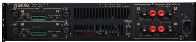
XM4180 Rear Panel