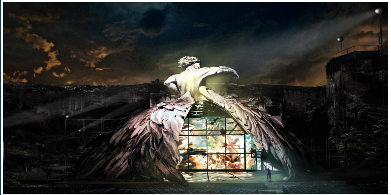
Picturall quad-output media servers drive a 340 m 2 LED wall for Puccini's Tosca in a Roman quarry in St Margarethen (Austria)