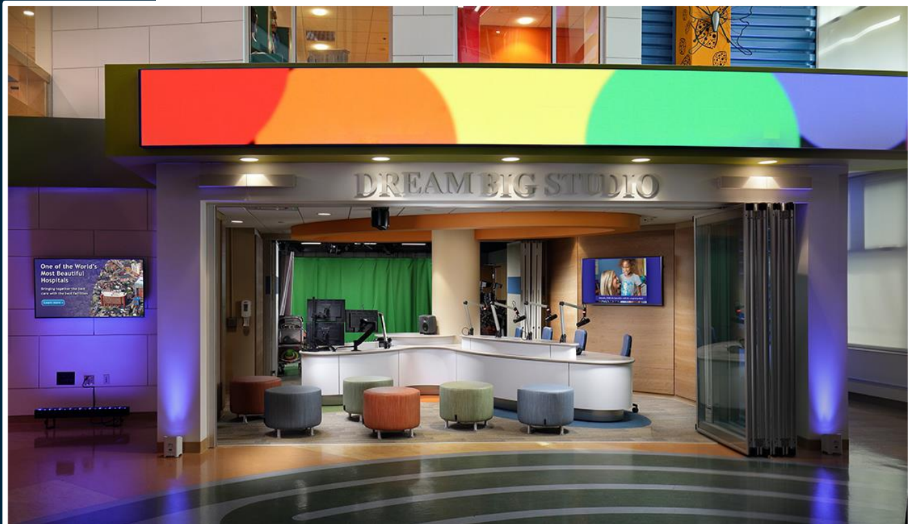
Picturall Quad media server drives LED video display at Hospitalized Children's Hospital's Media Production Facility (USA)