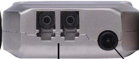
2 Strand LC-LC Fiber Optic Cable Input