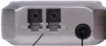
2 Strand LC-LC Fiber Optic Cable Input