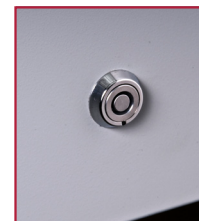
Stainless steel key lock